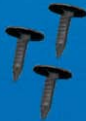
CLOUT NAILS Sizes: 1/2" to 2"