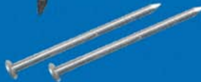
RING SHANK NAILS Sizes: 1" to 3"