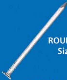
ROUND WIRE NAILS Sizes: 1/2" to 5"

Note: These nails are available in bulk pack as well box polybags.