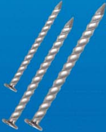
THREADED NAILS Sizes: 1" to 3"